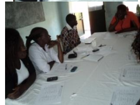
Bible study lesson in progress