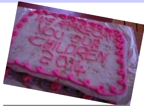
The cake was written, 'we appreciate our children 2014'

Me and my children at the Centre. Am a proud mother of clean, healthy, happy, well behaved and blessed children. Don't you just Envy me!!!! Glory be to God.